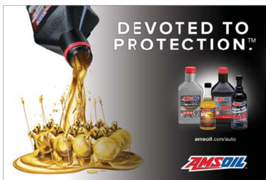
Retail Counter Mat (G3351)