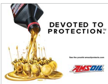
Window Decal 9"x12" (G3356)