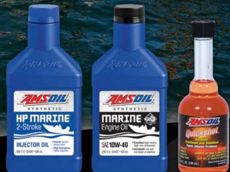
SYNTHETIC 2-STROKE OIL