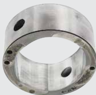
VANE PUMP CAM RING

Order by Phone 1-800-956-5695 - Give Operator Reference #5562531