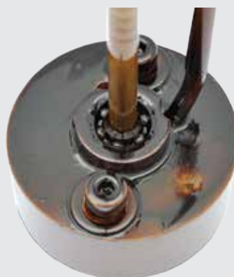
LEADING CONVENTIONAL HYDRAULIC FLUID (ISO 46)