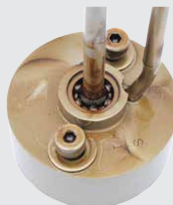
AMSOIL SYNTHETIC MULTI-VISCOSITY HYDRAULIC OIL (ISO 46)