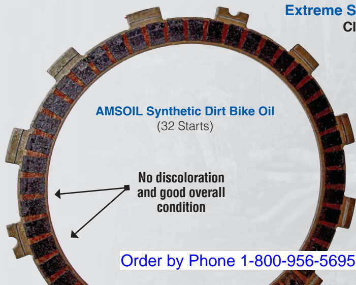
AMSOIL Synthetic Dirt Bike Oil (32 Starts)

No discoloration and good overall condition