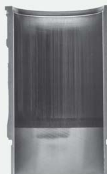
Severely Scuffed Liner