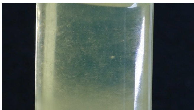
Wax crystals in untreated diesel fuel. The wax crystals will eventually fall out of solution and plug the fuel filter.