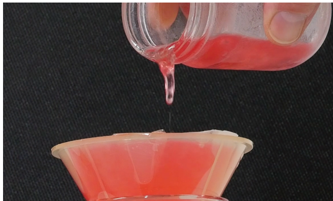
Wax formation in untreated diesel fuel resists pouring.

lowers the cold filter-plugging point (CFPP) by up to 40°F (22°C) in ULSD.