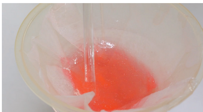
Wax formation in untreated diesel fuel plugs a coffee filter.