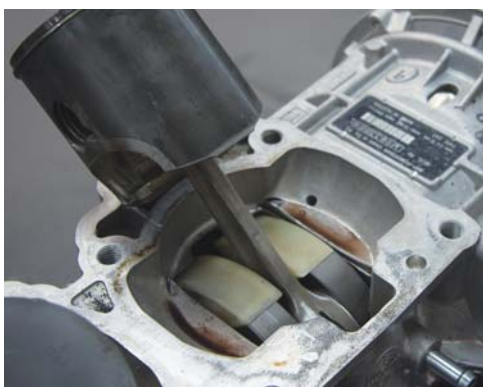
The pistons suffered only minor scuffing.